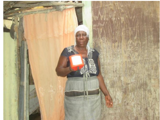
Figure 1. Woman who received a solar lamp through the distribution